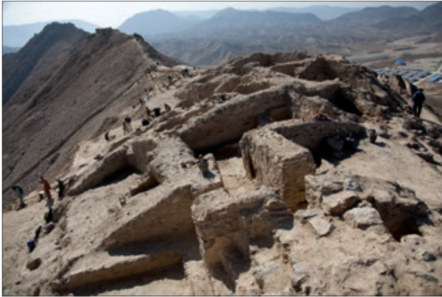
Archeologists discovered ancient Buddhist settlement at Mes Aynak in Logar Province, which sits above enormous copper deposit (Jerome Starkey)

on the central government's ability to hold sway over its interaction with bilateral partners, as well as domestic tribes, through the years to come. A number of possible outcomes could occur based on the dynamics of the internal makeup, tribes and their influence within the country, and ties outside the country.