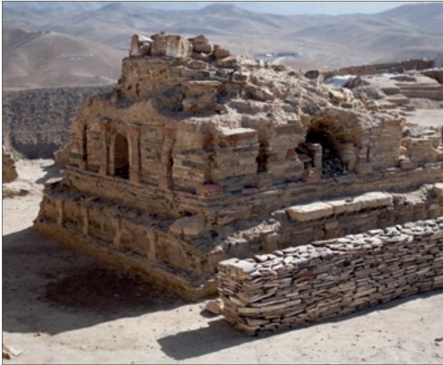
Excavated Buddhist shrine at Mes Aynak (Jerome Starkey)

problem of choosing a track gauge (distance between the inside edges of the rails that make up the track). According to Piers Connor, an independent consultant on global railway operations, the countries surrounding Afghanistan all have different gauges—a legacy from the days of colonial expansion. 29 Before any track is laid, Afghanistan has to decide which gauges to use, or backers must be prepared to take costly steps to overcome the differences.